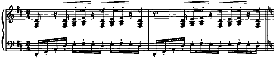
Example 1. continued

After the two-measure interlude, shown at the end of Example 1, the miners, who had just echoed Jake's "quanto piangerà," continue to sing along with him. Their words are as follows: 5